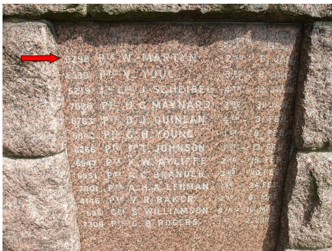
Memorial to 1 st Training Battalion A.I.F. at Durrington Cemetery